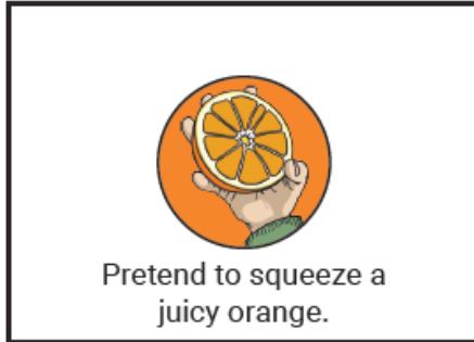
Pretend to squeeze a juicy orange.