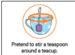
Pretend to stir a teaspoon around a teacup.