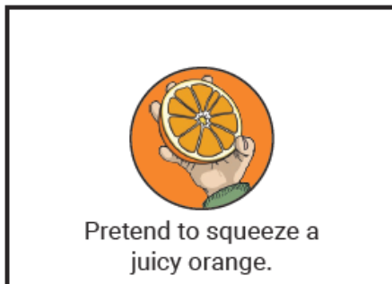
Pretend to squeeze a juicy orange.