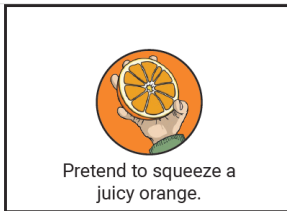
Pretend to squeeze a juicy orange.