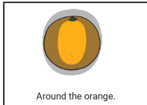
Around the orange.