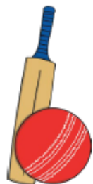
bat and ball